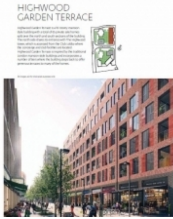
HIGHWOOD GARDEN TERRACE

Highwood Garden Terrace is a modern apartment building with a mix of brick and glass. It features a central courtyard and is surrounded by greenery. The building is situated on a street with other buildings and trees in the background.